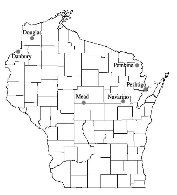
Figure 1: American Woodcock collection sites 1999–2001.

American Woodcock.—Detailed methods of woodcock sample collection and analysis can be found in Strom et al. (2005). Briefly, woodcock were harvested between 1999 and 2001 at selected locations in Wisconsin using steel shot (Figure 1). Birds were collected a minimum of two weeks prior to the regular hunting season (late September through early November) to increase the probability that only locally exposed birds (young of year) would be collected. Woodcock age and sex were determined via plumage characteristics as described by Sepik (1994). Pointing dogs were used to assist in finding woodcock nests and broods. When a brood was found, one chick was randomly selected and